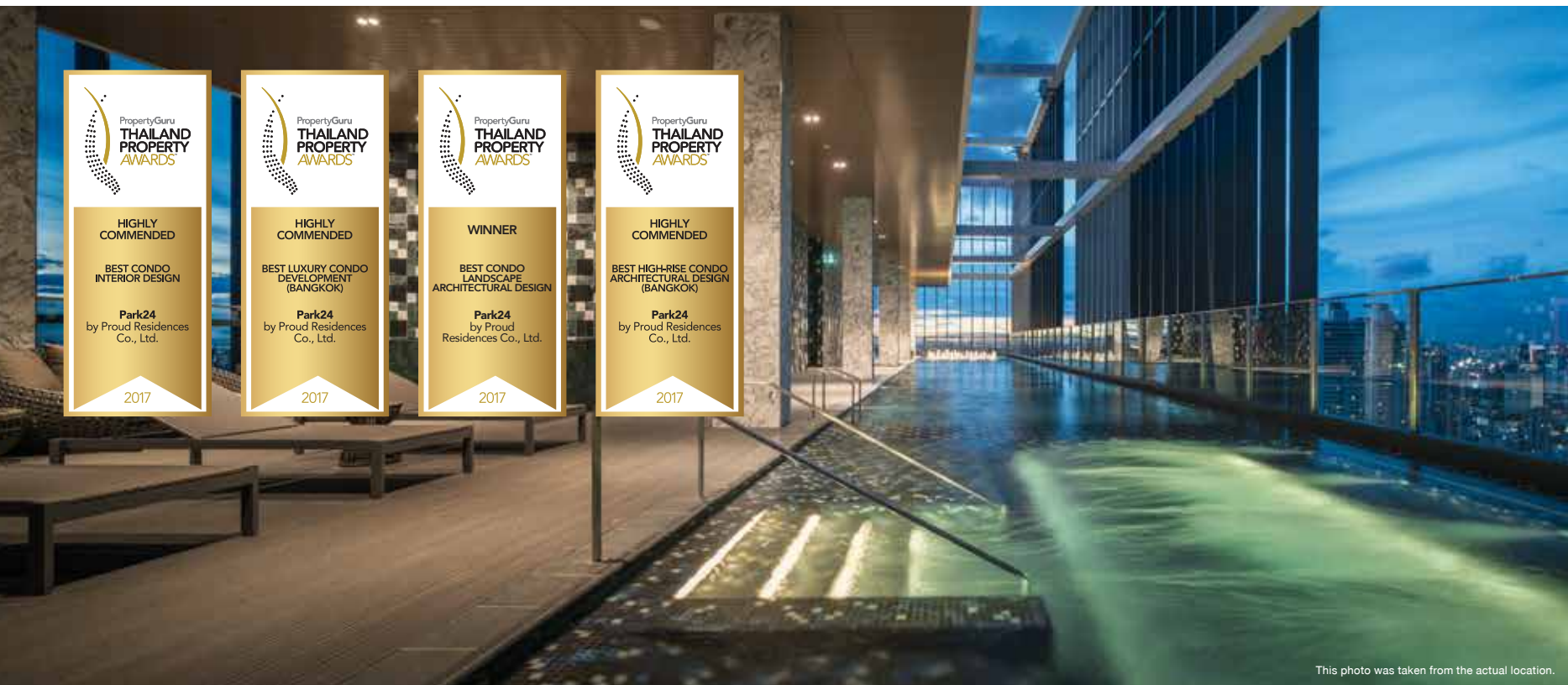
This photo was taken from the actual location.