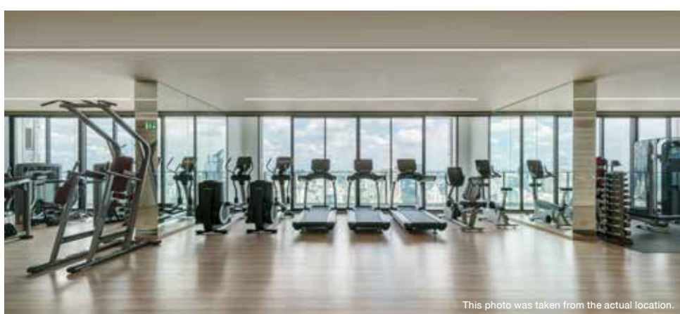
This photo was taken from the actual location.

Lobby, Mail Room, Swimming Pool, Jacuzzi, Children Pool, Fitness, Yoga Studio, Stream Room, Library, Living Room, Outdoor Deck, Meeting Room, Playground, Garden, Wi-Fi at Lobby, Shuttle Bus Service, CCTV, Key Card, Digital Door Lock, Security Guard.