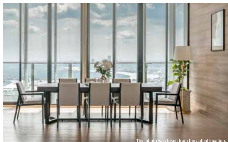
This photo was taken from the actual location.